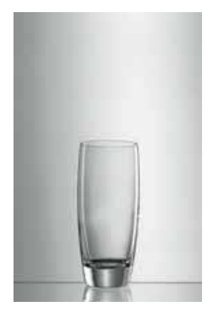
Highball / Beer tumbler 31 / 31 d / 10<sup>1/</sup>2 oz Art-Nr: 9869231 Height: 146 mm Weight: 235 g, Ø 64 mm

Water tumbler 26 / 26 cl / 8<sup>4</sup>/5 oz Whisi Art-Nr: 9869226 Art-N Height: 102 mm Height Weight: 245 g, Ø 73 mm Weight