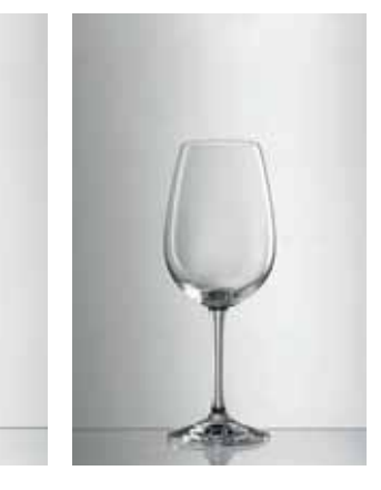
White wine 02/33 cl / 11<sup>1</sup>/7 oz Art-Nr: 9829002 Height: 199 mm Weight: 165 g, Ø 75 mm