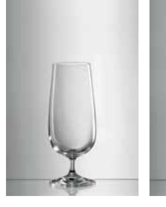
Beer glass 19 / 42 d / 14<sup>1/5</sup> oz Water goblet 16 / 27 d / 9<sup>1/10</sup> oz Art-Nr: 9829019 Art-Nr: 9829016 Height: 180 mm Height: 132 mm Weight: 175 g, Ø 72 mm Weight: 155 g, Ø 73 mm