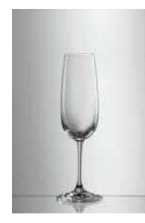
Champagne flute 07 / 23 cl / 7 <sup>3</sup>/<sub>4</sub> oz Art-Nr: 9829007 Height: 217 mm Weight: 165 g, Ø 70 mm