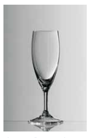
Champagne flute 07 / 15 cl / 5 oz Art-Nr: 9969007 Height: 180 mm Weight: 145 g, Ø 67 mm Available with 0,10 l filling mark