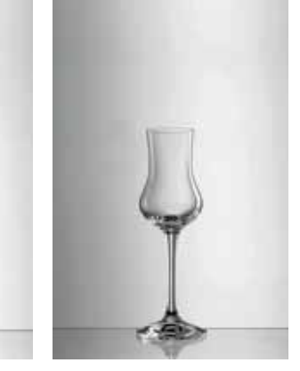
Schnaps glass 17 / 10 cl / 3 ½ oz Art-Nr: 9829017 Height: 175 mm Weight: 110 g, Ø 57 mm