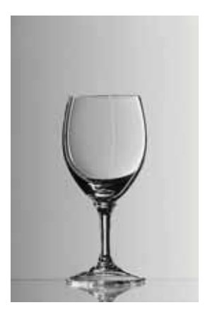
Wine glass 02 / 25 cl / 8 <sup>1/2</sup> oz Art-Nr: 9969002 Height: 161 mm Weight: 145 g, Ø 74 mm Available with 0,20 l filling mark