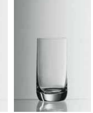
Beer tumbler 30 / 30 cl / 10<sup>1</sup>/7 oz Art-Nr: 9929230 Height: 133 mm Weight: 205 g, Ø 65 mm Available with 0,20 l filling mark