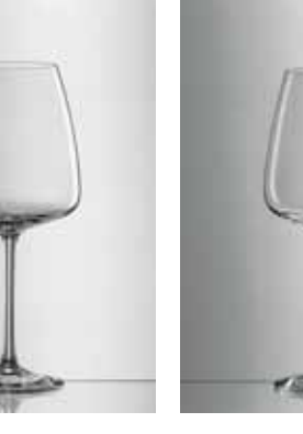
Claret 01 / 46 cl / 15<sup>1/2</sup> oz Art-Nr: 9839001 Height: 219 mm Weight: 160 g, Ø 90 mm

Goblet 00 / 60 cl / 20 <sup>1/4</sup> oz Art-Nr: 9839000 Height: 222 mm Weight: 190 g, Ø 100 mm