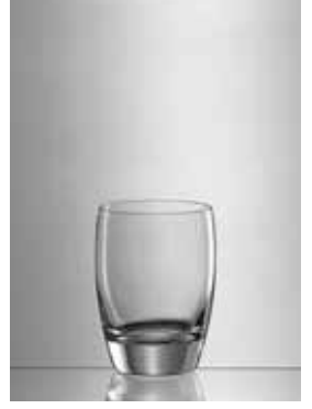
Whisky tumbler 34 / 34 cl / 11 <sup>1</sup>/2 oz Art-Nr: 9869234 Height: 109 mm Weight: 290 g, Ø 80 mm