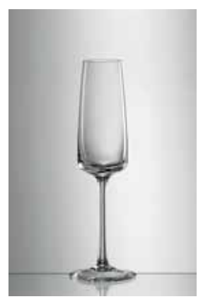
Champagne flute 07 / 19 cl / 6 <sup>2</sup>/<sub>5</sub> oz Art-Nr: 9839007 Height: 233 mm Weight: 160 g, Ø 72 mm