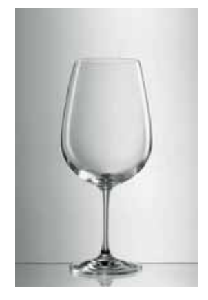
Goblet 92 / 69 cl / 23 <sup>1</sup>/3 oz Art-Nr: 9829092 Height: 229 mm Weight: 235 g, Ø 100 mm

Selected in conjunction with Eisch, this limited range of large-capacity, tapering glasses by the name of Vino Nobile, with subtly ground rims, enables the drink to develop a perfect bouquet. Dishwasher-safe glasses produced by a fully automated process, for perfect drinking enjoyment.