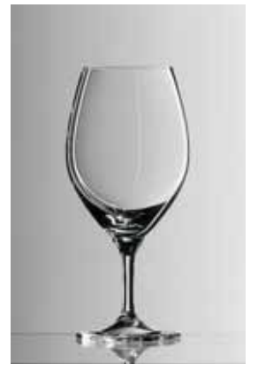
Universal glass 19 / 36 cl / 12 <sup>1/6</sup> oz Art-Nr: 9969019 Height: 183 mm Weight: 190 g, Ø 85 mm Available with 0,30 l filling mark