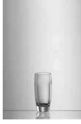
Shot glass 7 / 7 cl / 2 <sup>1</sup>/<sub>3</sub> oz Art-Nr: 9869207 Height: 90 mm Weight: 80 g, Ø 41 mm

If discreet elegance is the quality you are looking for, consider the Basic series of tumblers. The gently curving shape makes Basic an aesthetic delight. The restrained formal idiom blends in harmoniously with a wide range of tabletop patterns, making Basic incredibly versatile.