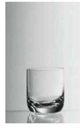
Whisky tumbler 29 / 29 cl / 9 <sup>4</sup>/<sub>5</sub> oz Art-Nr: 9929229 Height: 87 mm Weight: 190 g, Ø 78 mm