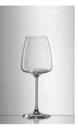
White wine 02 / 35 cl / 11 <sup>4/s</sup> oz Art-Nr: 9839002 Height: 207 mm Weight: 145 g, Ø 83 mm